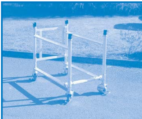
7. Remove the feet or castors from the bottom of the folding frame (see 1. on previous page) and re fit them into the bottom of the booster frame retaining them in the same manner. Stand the frame on its feet or castors and open it out to form a rectangle. Clip the short brace into position over the pegs provided.