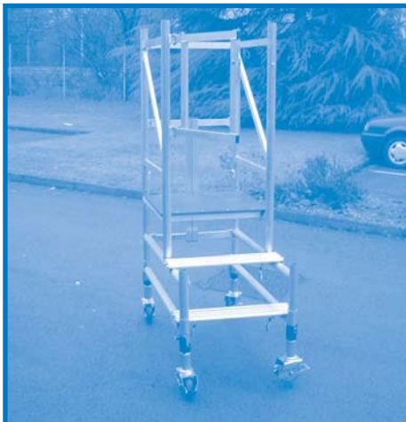
4. Locate the platform unit onto one of the three lowest rungs of the two end frames.