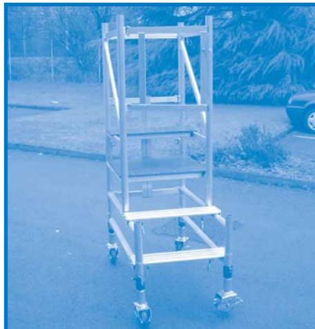
5. If required the hop up platform can be fitted on the fourth rung up.