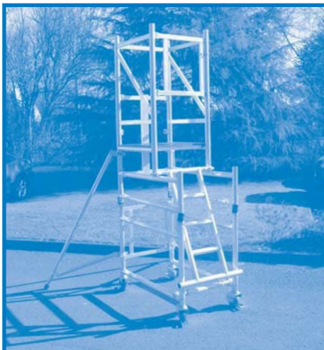
10. Fit stabilisers to front uprights of unit ensuring wing nuts are tightened

IMPORTANT The hop up platform can be located one rung above the working platform but should not be used as a working platform itself. It is supplied only to avoid over stretching and should be used as a "step up" only to carry out short duration tasks. It should be used for no more than 15 minutes.