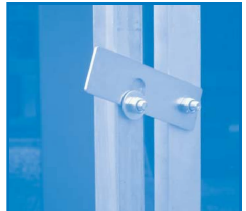
6. It is now safe to mount the unit after ensuring that the unit is level and stable. If castors are fitted ensure that their brakes are on (Press the brake bar on the castors down). Before starting work close the gate behind you using the drop down latch.