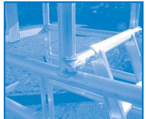
9. Remove the clip on tread from folding frame and replace them with the booster ladder ensuring that the clip on hooks are engaged around the frame uprights. Check that the unit is level, and brakes are on. Before starting work close the gate behind you using the drop down latch.